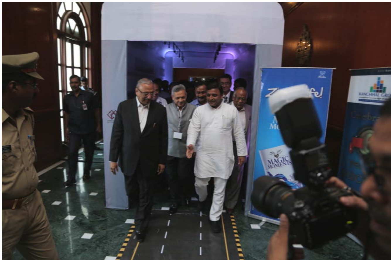
Model of Lucknow Metro