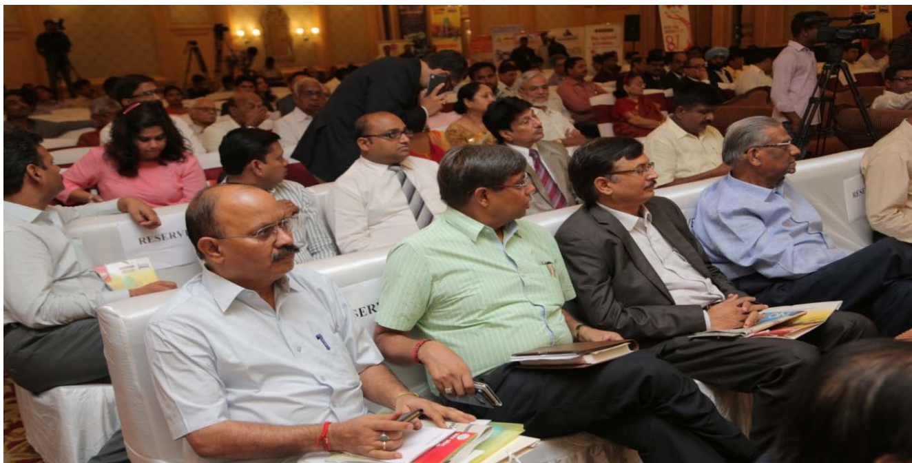
Audience view at the Summit