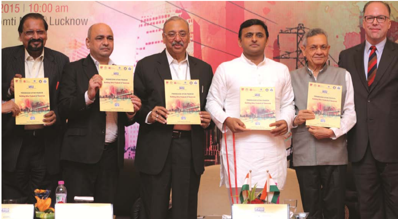
Launch of Study on Progressive Uttar Pradesh by Hon'ble Chief Minister of UP, Shri Akhilesh Yadav ji