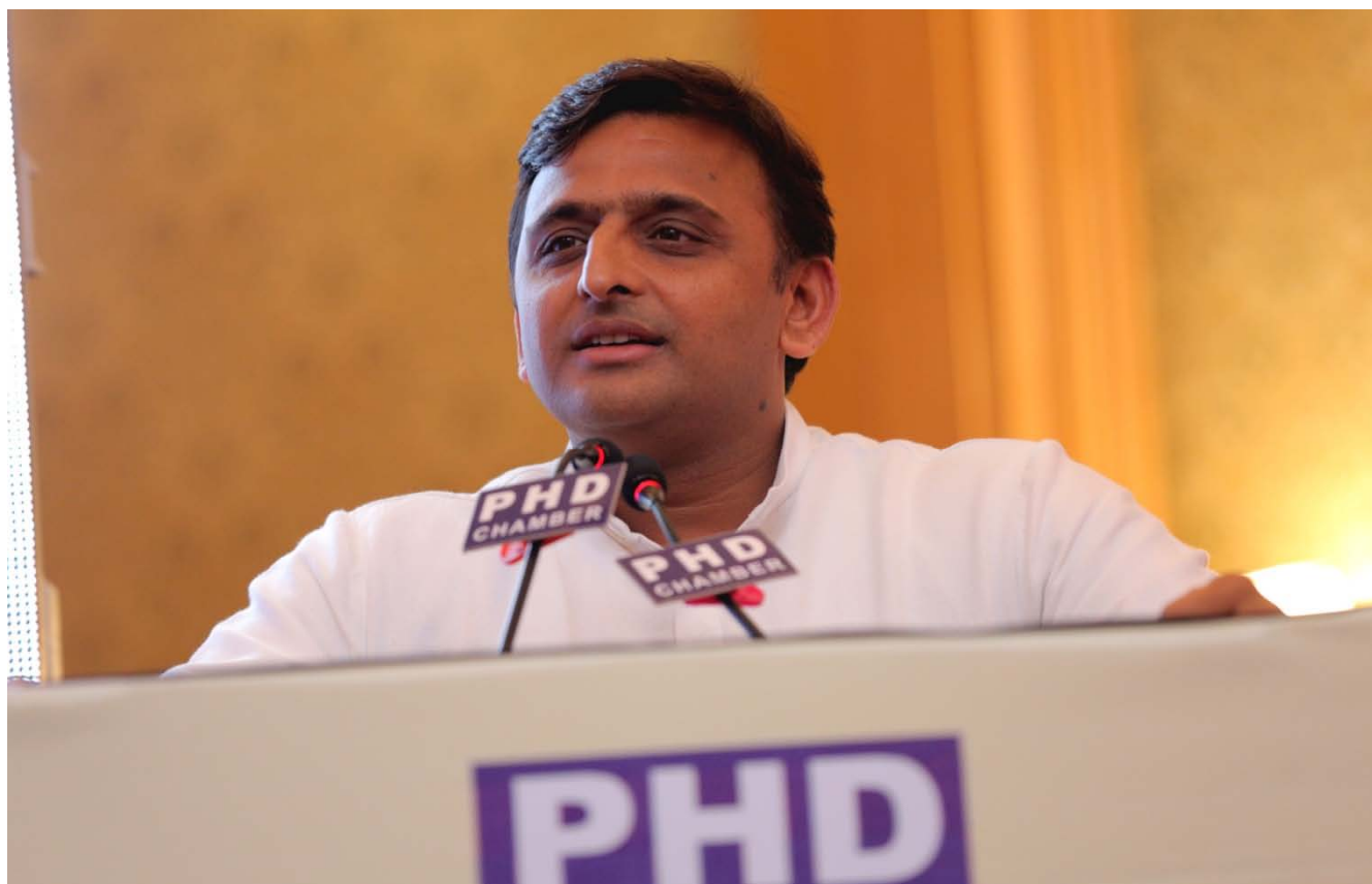
Hon'ble Chief Minister of Uttar Pradesh, Shri Akhilesh Yadav ji addressing the gathering