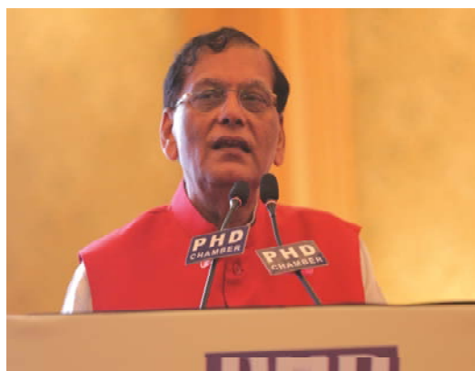
Dr Bindeshwar Pathak (Padam Shree) Founder, Sulabh International